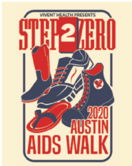
These boots are made for stepping to zero with AIDS Walk Austin Saturday.